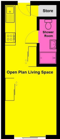
Fleet Court, 25 OLD MILTON STREET,LEICESTER, LE1 3BB

This stylish new City Centre development, has fobs for access to external doors into the building and what will be small courtyard style gardens. With individual mailboxes, and an array of attractive and spacious communal hallways. There are communal courtyard style gardens .